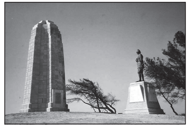
Figure 2. New Zealand and Atatürk Memorial, Chunuk Bair, Gallipoli; the trees are Turkish red pine (Pinus brutia), native to the area.

Numerous commemorative pine trees have been planted in Australia and New Zealand supposedly derived from pine cones brought back by soldiers from Gallipoli. They include radiata pine ( Pinus radiata ), stone pine ( Pinus pinea ), Canary Island pine ( Pinus canariensis ), Aleppo pine ( Pinus halepensis ), and Turkish red pine ( Pinus brutia ).