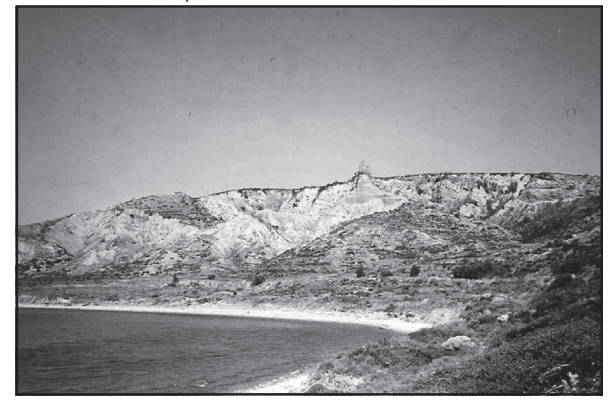
Figure 1. Anzac Cove, Gallipoli, Turkey; the prominent rock is known as the Sphinx.

Gallipoli is in Thrace, the European part of Turkey where it is called (in Turkish) Gelibolu Yarimadas or the Gallipoli Peninsula. The southern part of the Gallipoli Peninsula is covered by forests of Turkish red pine ( Pinus )