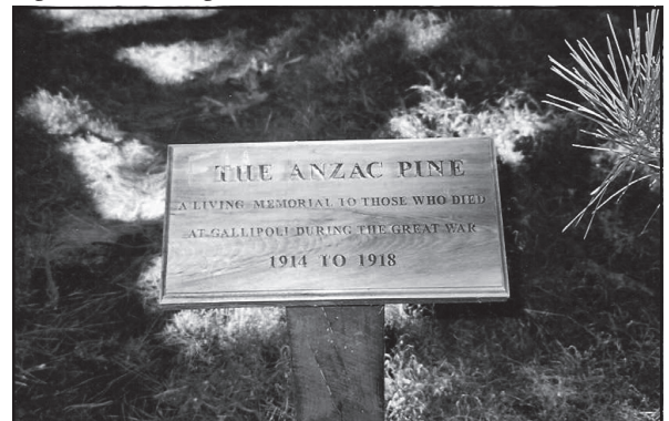
of Hastings to honour all those who served in that Great War, and in particular for all those Hawkes Bay lads who so gallantly fought and died.

Today the proud old tree stands watch over the plains, sad and lonely, a veteran and a remnant of a much older stand. On the ANZAC memorial at Chunuk Bair these words appear, engraved in stone: 'From the Uttermost Ends of the Earth'. Those too are fitting words to describe the Lone Pine upon the ridge of Te Mata. Far from 'home', and alone she sings, 'At the going down of the sun, and in the morning, I will remember them...' Lest we Forget."