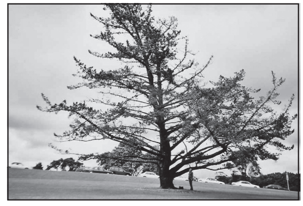
Figure 9. The radiata pine ( Pinus radiata ) in front of the Auckland War Memorial Museum.

Paeroa: A tree was planted by J. Jensen at Primrose Hill, Paeroa, near the War Memorial on a hill above the town. The seeds were reputed to have come from the Melbourne Botanic Gardens from a tree which was a progeny of the Gallipoli Lone Pine, said to be Pinus halepensis , which grew close to Brighton Beach, Anzac Cove. Another tree was planted on a local Paeroa Golf Course (Burstall & Sale 1984). The Primrose Hill tree is not there now, but the one on the golf course is still alive and well - a gnarled veteran - and it is Pinus brutia , not Pinus halepensis (Figure 10).