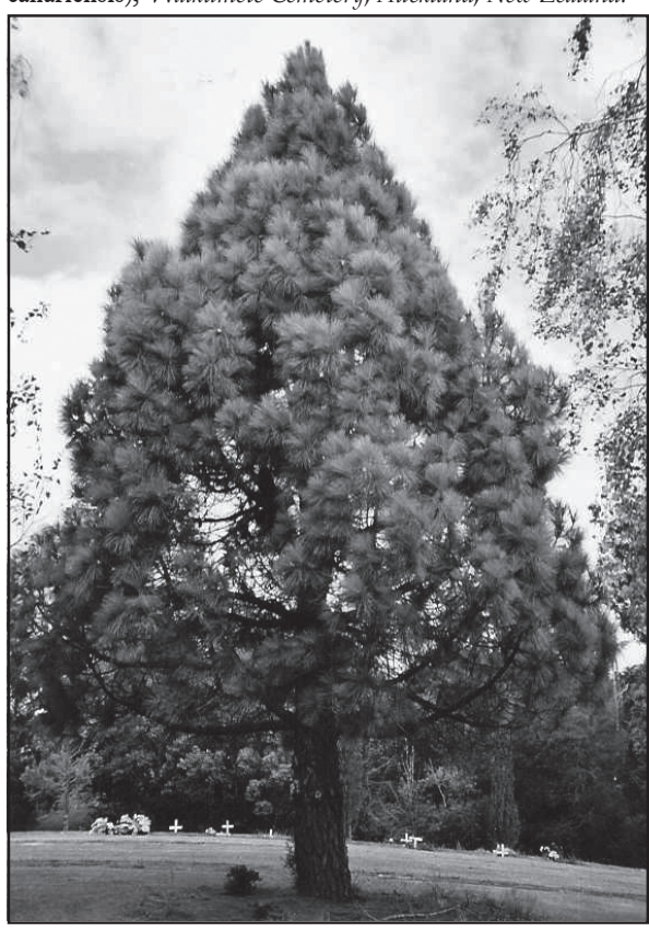
Figure 7. The commemorative Canary Island pine (Pinus canariensis), Waikumete Cemetery, Auckland, New Zealand.