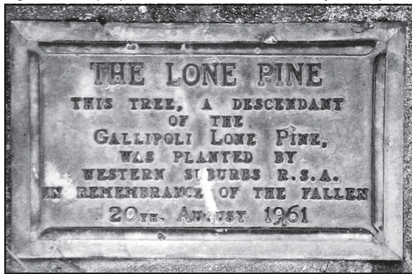
Figure 8. The plaque beside the Waikumete Canary Island pine.

We can therefore assume that the Primrose Hill trees was also P. brutia . The Paeroa Golf Course tree could well be a genuine descendant of the Lone Pine from Sgt McDowell's original cone, derived from one of the 1933-34 trees planted in Melbourne and Warrnambool, though there is no tree from McDowell's original seeds recorded as planted in the Melbourne Botanic Gardens.