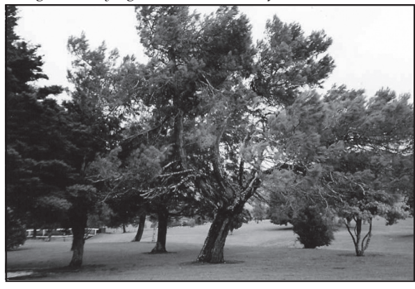
Figure 10. Turkish red pine (Pinus brutia), Paeroa Golf Course, planted in 1957 - possibly New Zealand's only descendant of the Lone Pine of Gallipoli, from the cone brought back by Sgt Keith McDowell after WW I.

Te Puke: A small pine tree behind the RSA club rooms, Oxford Street, Te Puke, is Pinus halepensis .