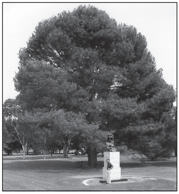
Figure 5. The plaque beside the Aleppo pine (Pinus halepensis), Australian War Memorial. Canberra.

Figure 4. Pinus halepensis, Australian War Memorial, Canberra, Australia.