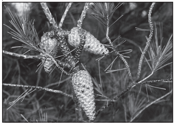
Figure 16. Cones of Pinus halepensis, Turkey; note the long peduncles and downward orientation on the branches.

planted at lower or higher altitudes. It occupies 3.1 million ha in Turkey (Figure 16). New Zealand's best specimen seems to be the tree in the Christchurch Botanic Gardens, and there are others in Eastwoodhill Arboretum, Gisborne, and two impressive specimens in the grounds Scion (the former Forest Research Institute) near the Whakarewarewa School, Rotorua.