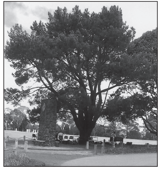
Figure 6. The Turkish red pine ( Pinus brutia ) tree, planted in 1933, at Wattle Park, Melbourne, Australia.

symbol of Australian nationhood and of its pride, devotion, courage, selflessness and sense of service to others.