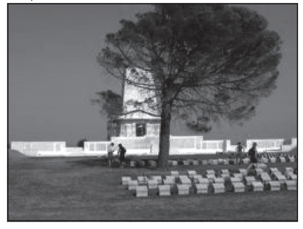
Figure 3. The stone pine (Pinus pinea) at Lone Pine Cemetery, Gallipoli.

ships and transports and were buried there. The New Zealand names are on the memorial itself, a large 'pylon' of Ulgaredere stone with large crosses set in relief on each face. The Australians are listed on walls in front of the pylon. Consequently, the sea around Gallipoli is a mass grave. As to the pine tree (Fig. 3), it has been referred to as an Aleppo pine (Wright 2003) but is actually a stone pine ( Pinus pinea ), which is not native to Gallipoli itself, but is frequent in the Aegean region of Turkey. It was planted in the 1920s.